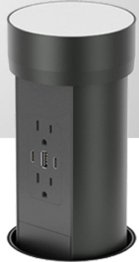
Point Pod Connect Black PPCV815B