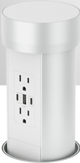
Point Pod Connect Silver PPCV815